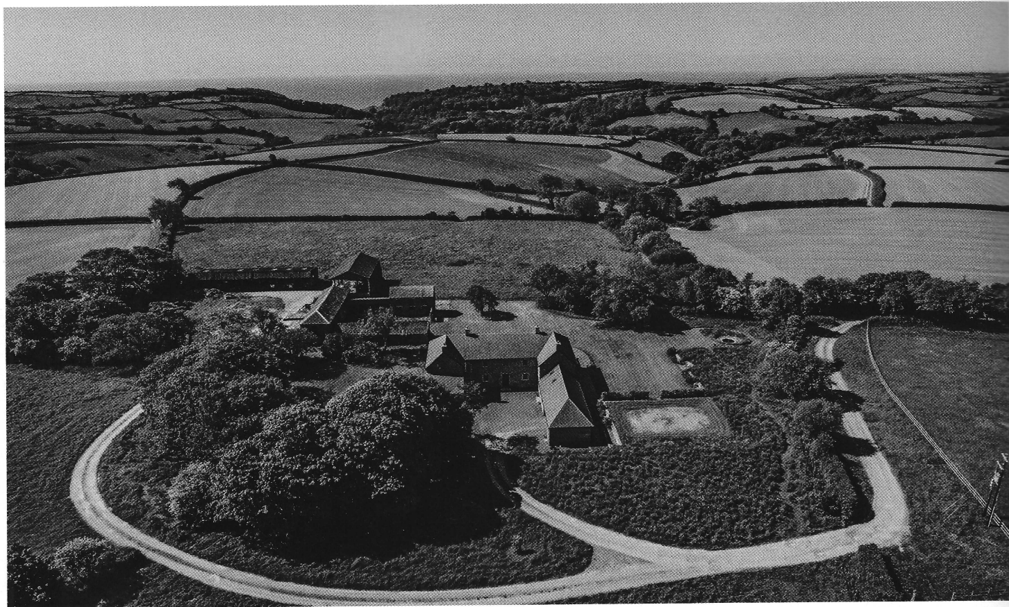
Above and below: Remodelled and restored Trevascus Farm is set in 26 acres of gardens and grounds near Caerhays, Cornwall. £3.75m