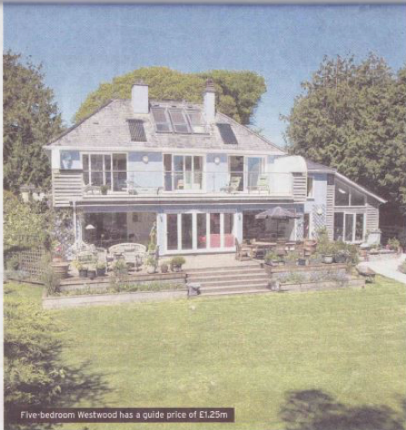
Five-bedroom Westwood has a guide price of £1.25m

■ For more information contact Jonathan Cunliffe on 01326 617447.